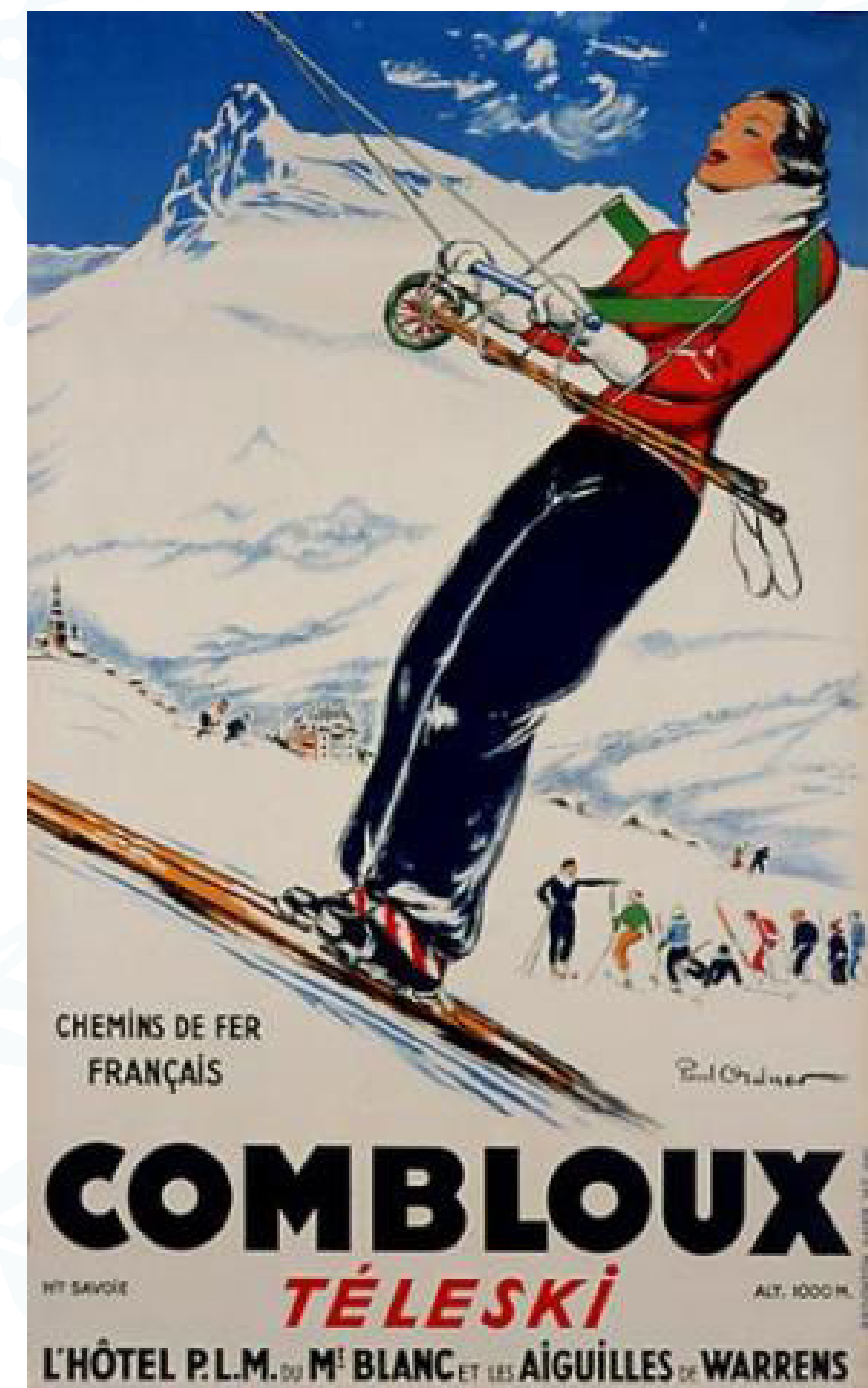
Skier in sling lift, Combloux, France c.1930