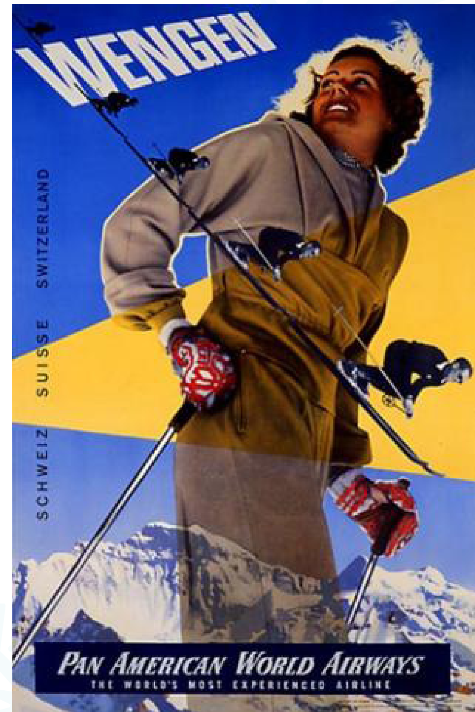
Wengen, Switzerland