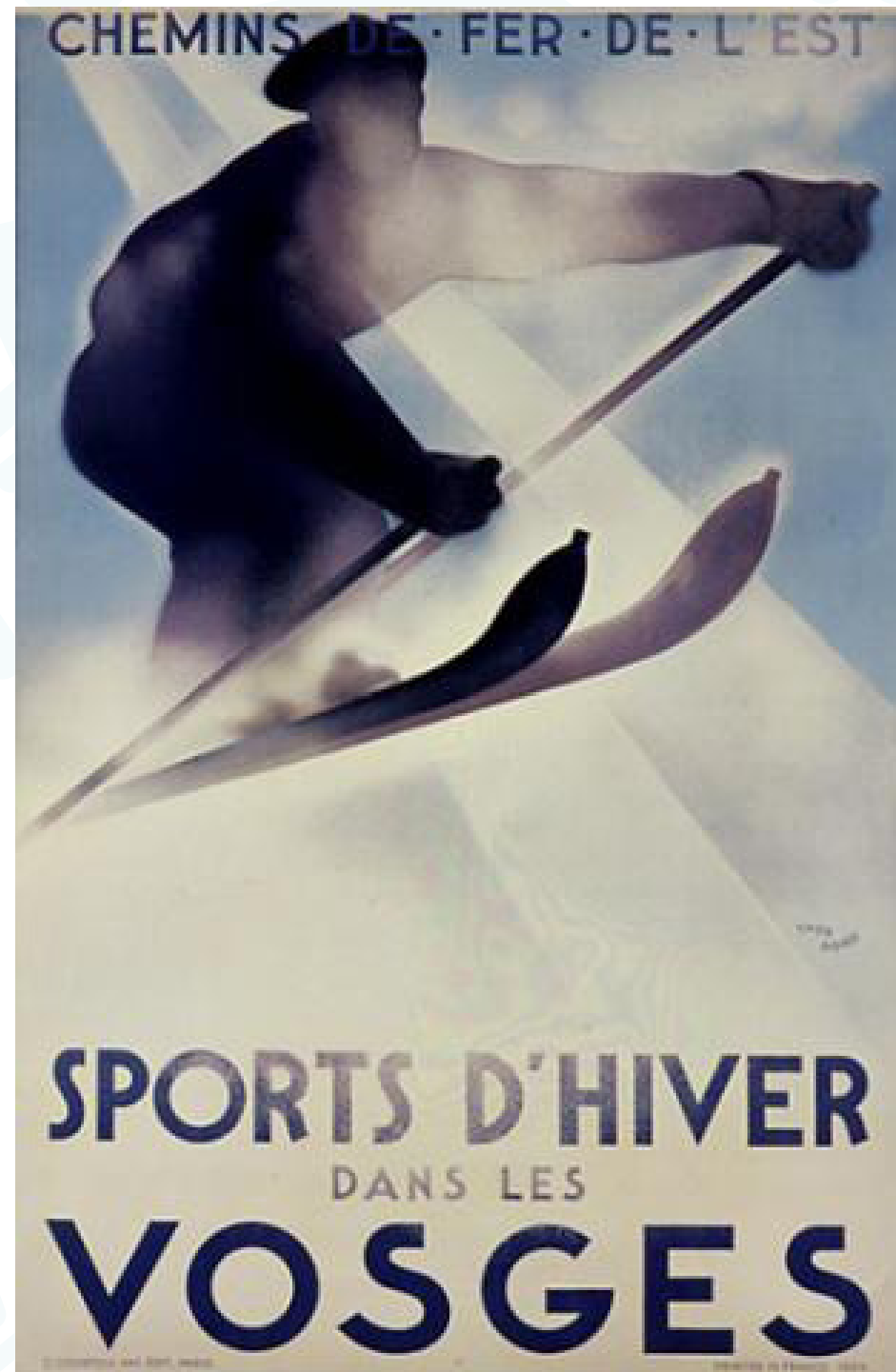
Winter Sports in the Vosges, France, French National Railways, Artist: Theo Doro, 1929