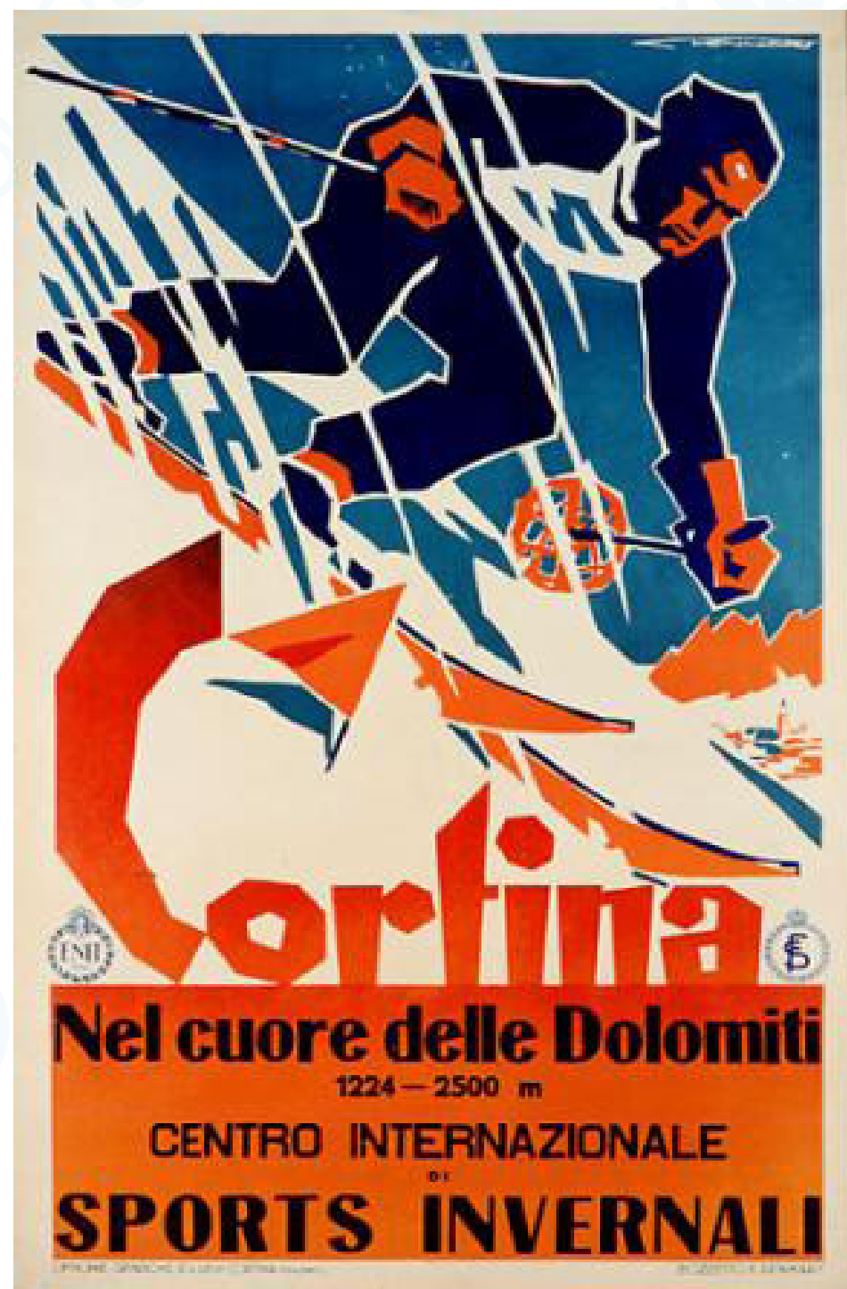
Cortina, Italy, Artist: Franz Lenhart, c.1930