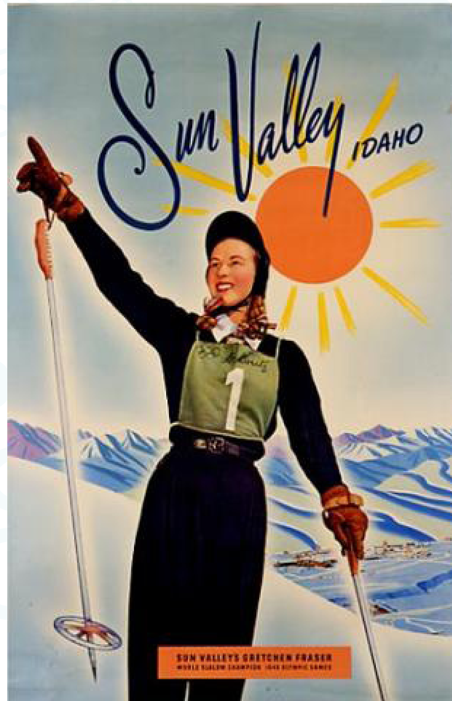
Gretchen Fraser, Sun Valley Idaho c.1950