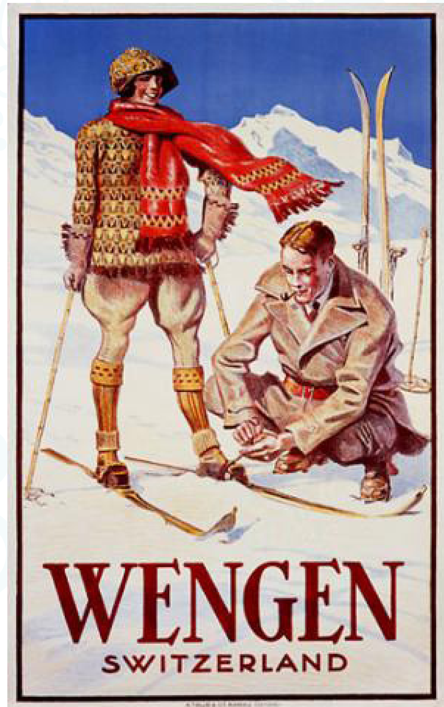
Wengen, Switzerland, c.1920