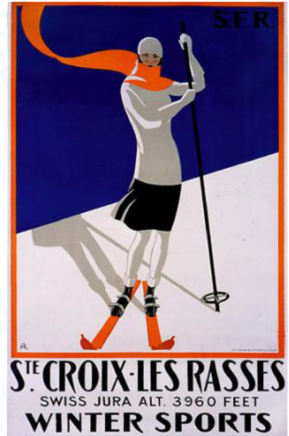
St. Croix-les Rasses, Jura, Switzerland, Swiss Federal Railways, 1922