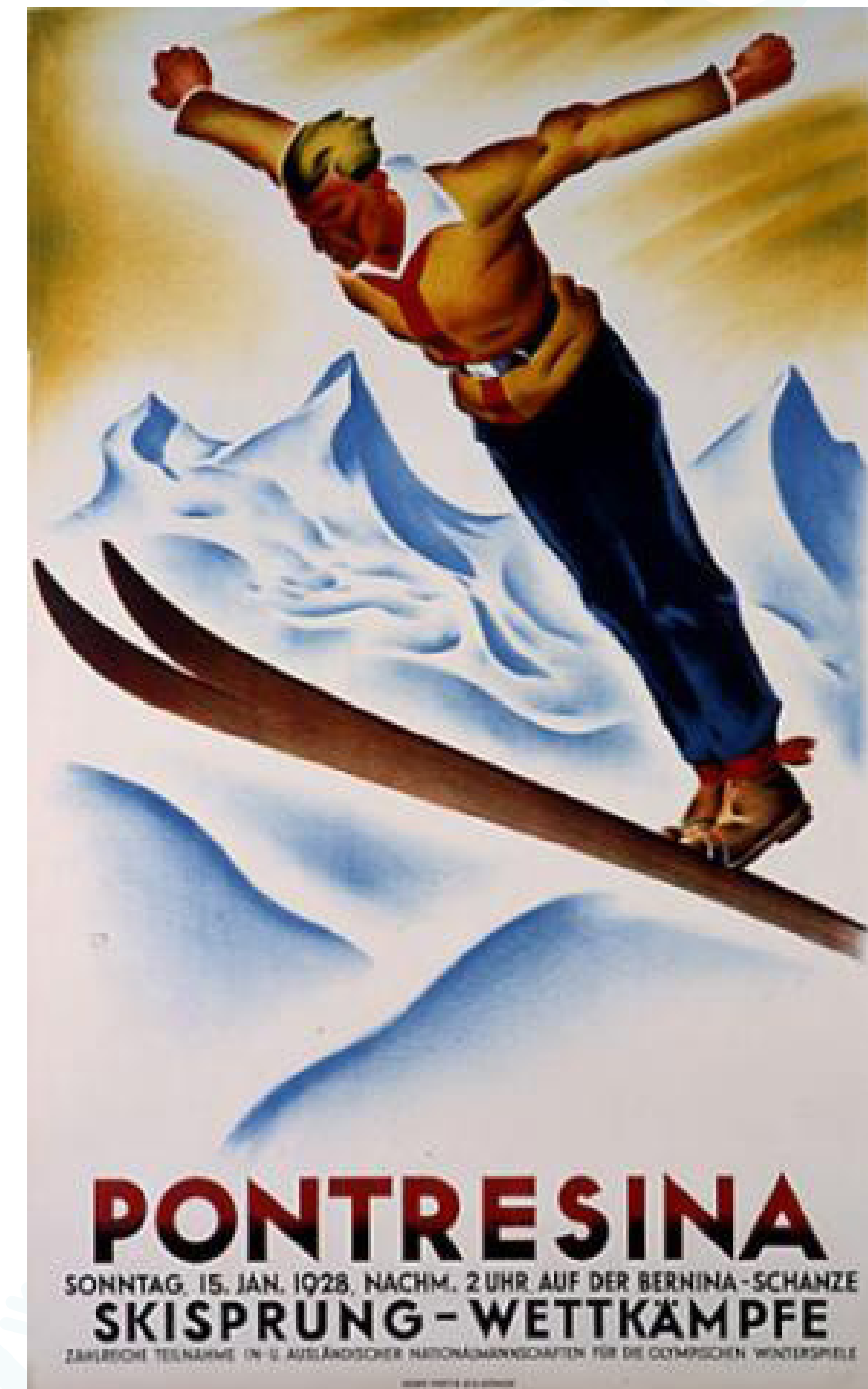
Pontresina, Switzerland, Artist: Carl Moos, 1928