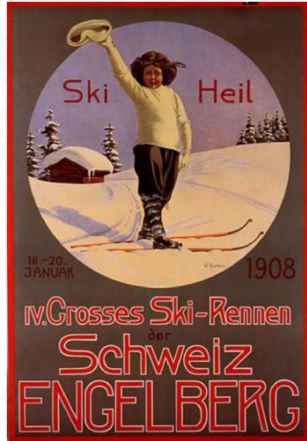
Engelberg, Switzerland, 1908