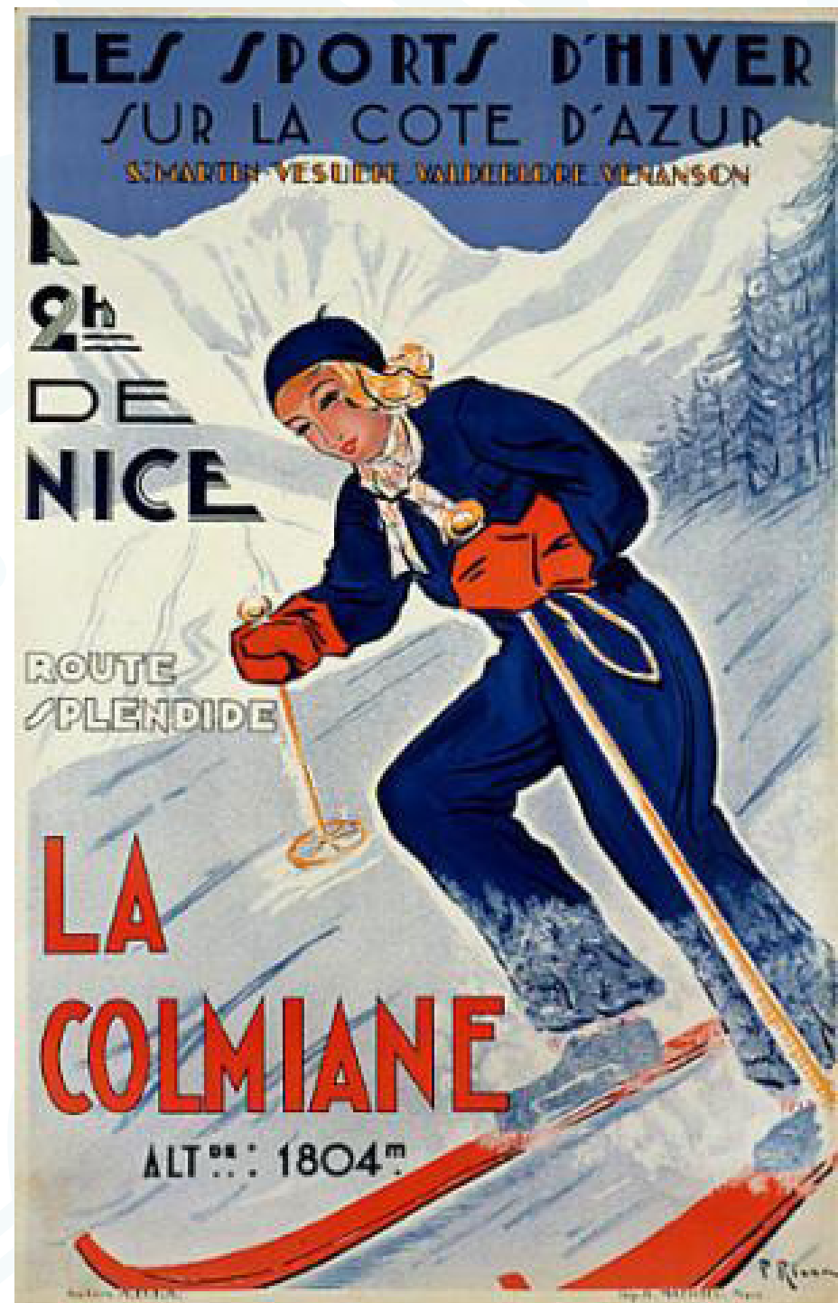
La Colmiane, France, c.1930