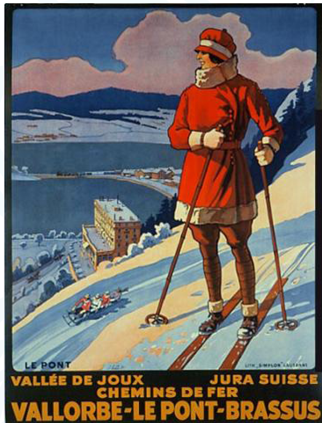
Vallorbe Le Pont Brassus, Switzerland, 1920's