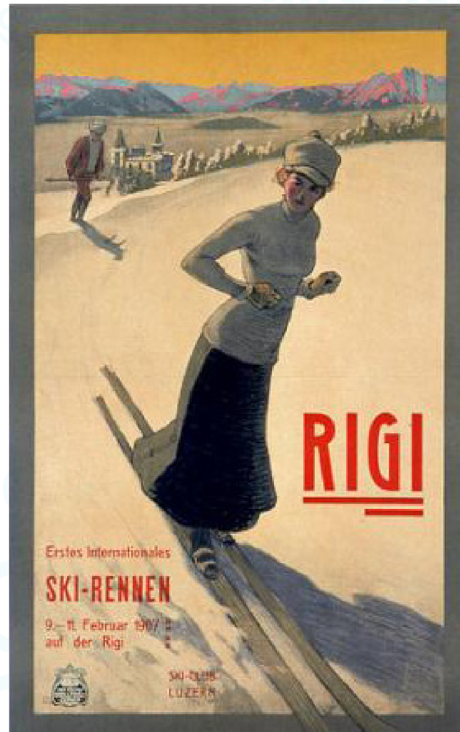
Rigi Ski Rennen, Switzerland, 1907, Artist: Orell Füssli