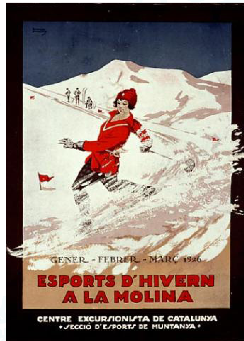
Molina, Spain, 1926