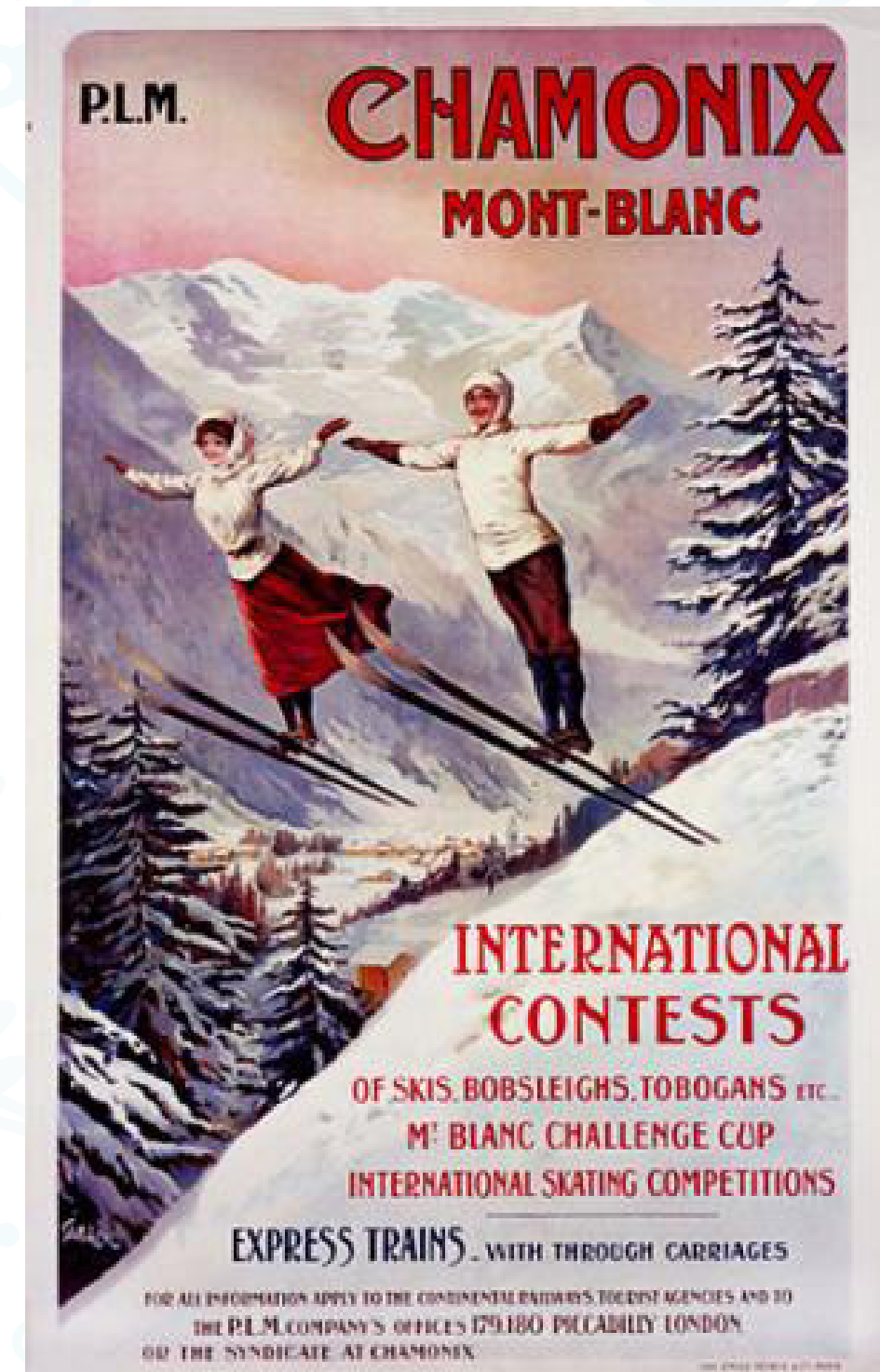
Chamonix, France, c.1905