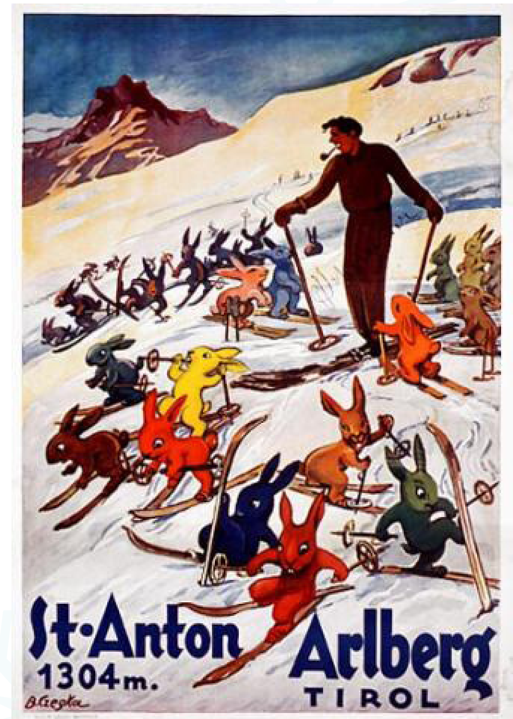
P17 St. Anton, Austria, 1930's